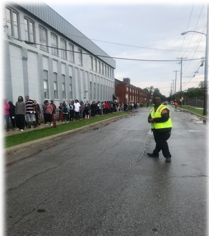
Figure 2 DMS Security conducting traffic and Job Seekers outside in line to apply