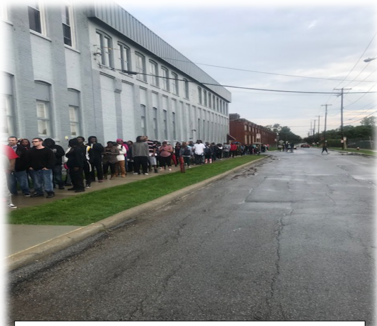
Figure 1 Job Seekers in line outside DMS/Pathway Hiring Event