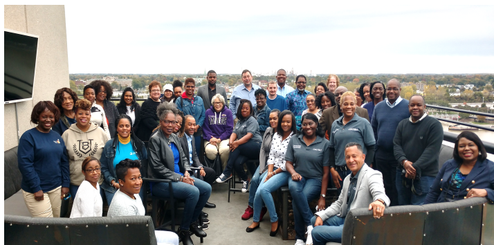
OURS Conference Attendees

Akron Summit Community Action, Inc. Cincinnati Hamilton County Community Action Agency Community Action Commission of Erie, Huron & Richland Counties Council for Economic Opportunities in Greater Cleveland IMPACT Community Action Lorain County Community Action Agency Mahoning Youngstown Community Action Partnership Pathway Toledo Stark County Community Action Agency Trumbull Community Action Program