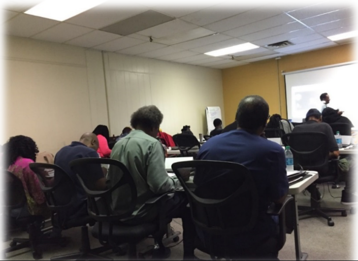
Figure 3 Zepf Staff Conducting Seven A's Workshop to Attendees at Pathway