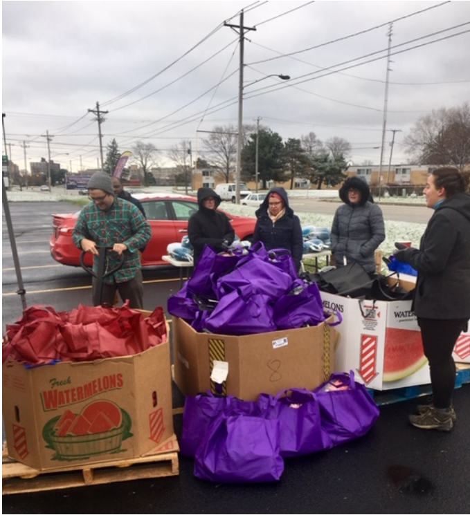
Food for Thought Volunteers distributing Thanksgiving Holiday Baskets

On November 20, 2018, Pathway and Food for Thought partnered together to distribute 52 Thanksgiving Holiday Gift baskets. The morning started out very cold, but everyone worked together to load up the vehicles to distribute the gift baskets to our chosen recipients.